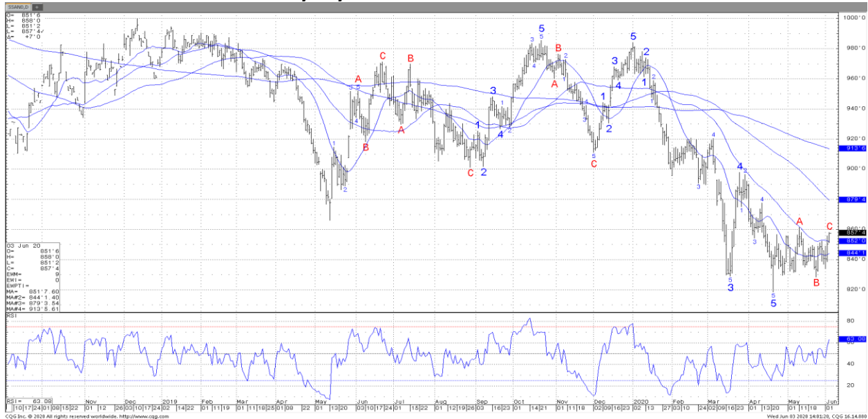
July soybean futures chart

Futures and options trading involve significant risk of loss and may not be suitable for everyone. Therefore, carefully consider whether such trading is suitable for you in light of your financial condition. The information and comments contained herein is provided by ADMIS and in no way should be construed to be information provided by ADM. The author of this report did not have a financial interest in any of the contracts discussed in this report at the time the report was prepared. The information provided is designed to assist in your analysis and evaluation of the futures and options markets. However, any decisions you may make to buy, sell or hold a futures or options position on such research are entirely your own and not in any way deemed to be endorsed by or attributed to ADMIS.